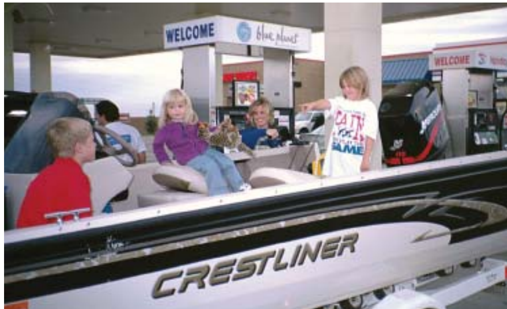
Sportfishing is an economic mainstay for communities across the country where outdoor recreation is popular. Anglers' expenditures on everything from tackle to hotels to gas grew by 33% since 1991.